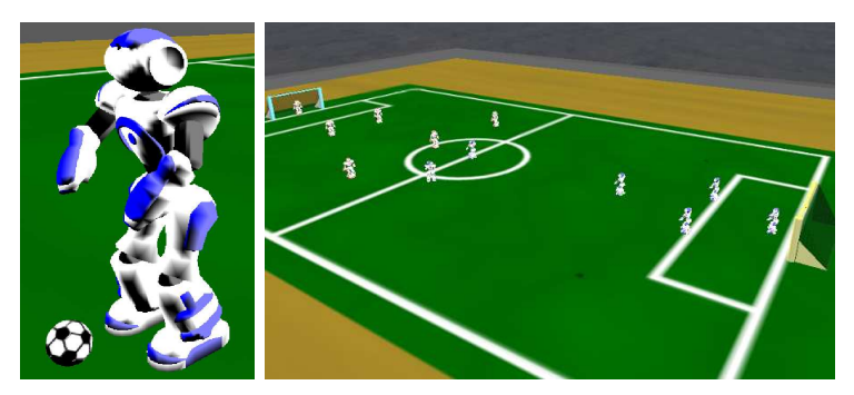
Figure 1. On the left is a screenshot of the Nao agent, and on the right a view of the soccer field during a 6 versus 6 game.

Since 2007 was the year the humanoid was introduced to the 3D simulation league, the major thrust in agent development thus far has been on developing robotic skills such as walking, turning, and kicking. This has itself been a challenging task, and is work still in progress. High-level behaviors such as passing and maintaining formations are beginning to emerge, but at this stage, they play less of a role in determining the quality of play when compared to the proficiency of the agent's skills.